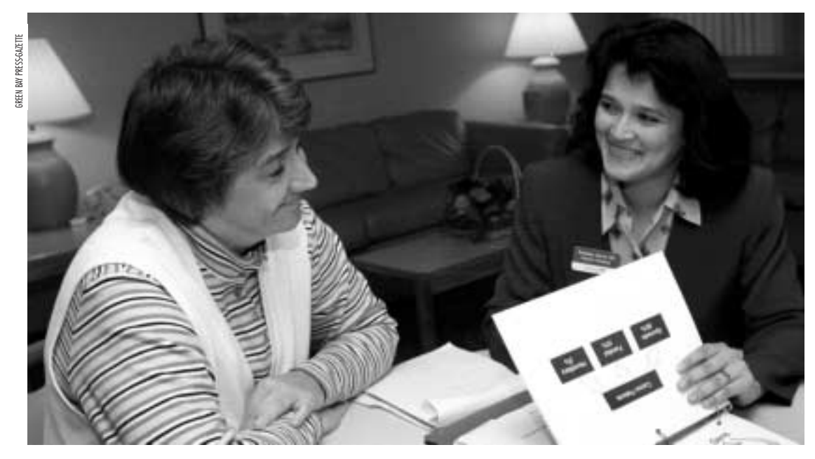
Ms. Ghate meets with a patient who has a family history of cancer.

Issue 4: Adult-onset disorders. The new genetics that promises to provide information about predispositions to adult-onset diseases also implies a far greater emphasis on adult genetics than is currently the case. As this occurs, modifications of education, training and funding will need to more adequately be addressed. Some experience has accumulated regarding provision of genetic services to individuals at risk for certain adult-onset diseases. For example, providers and consumers in cancer genetics programs have experience that may assist in planning models of care for other adult-onset disorders.